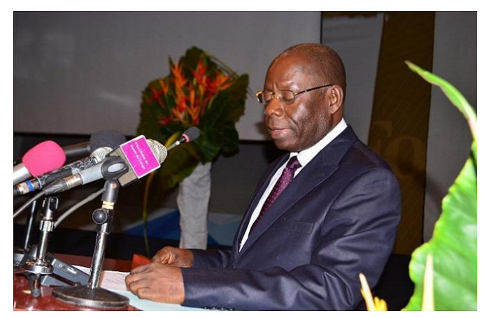
HALC Chairman raising the issue of corruption in the management of funds allocated to the response to Covid-19 during a vision conference with China

This visioconference organized by the National Supervisory Commission of the People's Republic of China (Chinese Embassy in Congo) was attended by the Secretary General of HALC, representing the President on a missions to Egypt on 9/12/2020.