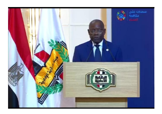
Speech by the President of HALC, President of the Association of Anti-Corruption Authorities of Africa (AAACA) in Egypt at the celebration of the International Anti-Corruption Day in a full conference room

3rd activity: Mission of the President of the HALC in his role as President of the AAACA, at the invitation of the Administrative Control Authority (ACA) starting on 8 december 2020.