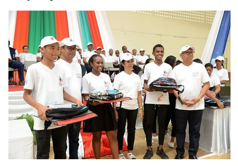
Laureates of various competitions

At the end of this series of speeches, the winners of various competitions (slam, best public services of Mahajanga, journalists "best reporters") received their awards from the authorities present just before the opening of the exhibitions.