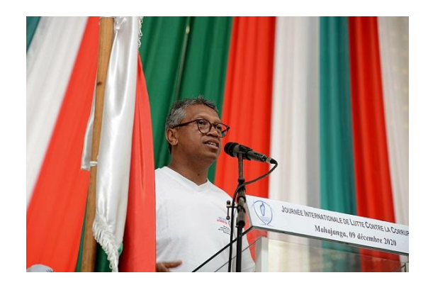
The BIANCO Director General during his speech

In his speech, the Director General of BIANCO reaffirmed the importance of the commitment of all to succeed in this fight: "We no longer need to persuade you that this fight concerns us all. Let us join forces to form this much desired anti-corruption coalition. Because this is the only condition for the victory".