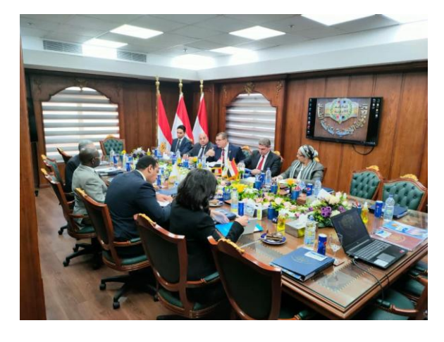
Working session of the AAACA President with the officials of the National Anti-Corruption Academy