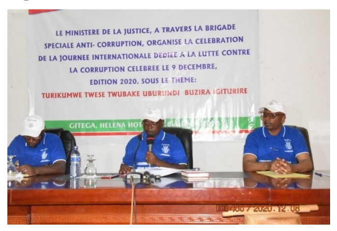
The Permenant Secretary (middle) during the pannel