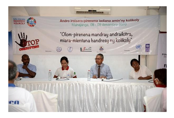
Conference/debate facilitated by BIANCO members

and on the other hand, at the conference-discussion facilitated by members of the Anti-Corruption System (SAC) on the theme "United against corruption".