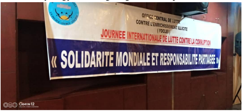
The theme bellow has been debated during the celebration of International Anti-Corruption Day

It was further noted that corruption can only be combated if the world stands together against this evil and if there is synergy in the fight against corruption in this Covid 19 period.