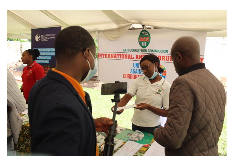
ACC members conducting awareness-raising campaigns

In following the stated guidelines, the Anti-Corruption Commission Zambia, decided to scale down this year's celebrations of this important day to institutional level. Institutions therefore conducted sensitization activities to their members within their institutions and also in observing health guidelines.