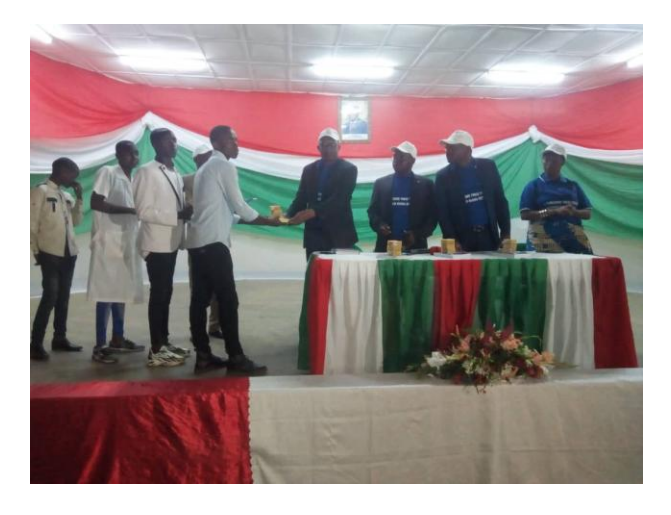
The Commissioner General of the SACB giving gifts to the students of the Anti-Corruption School Club of the Lycée MURAMVYA